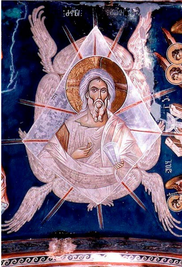
"The Ancient of Days," a 14th-century fresco from Ubisi, Georgia.